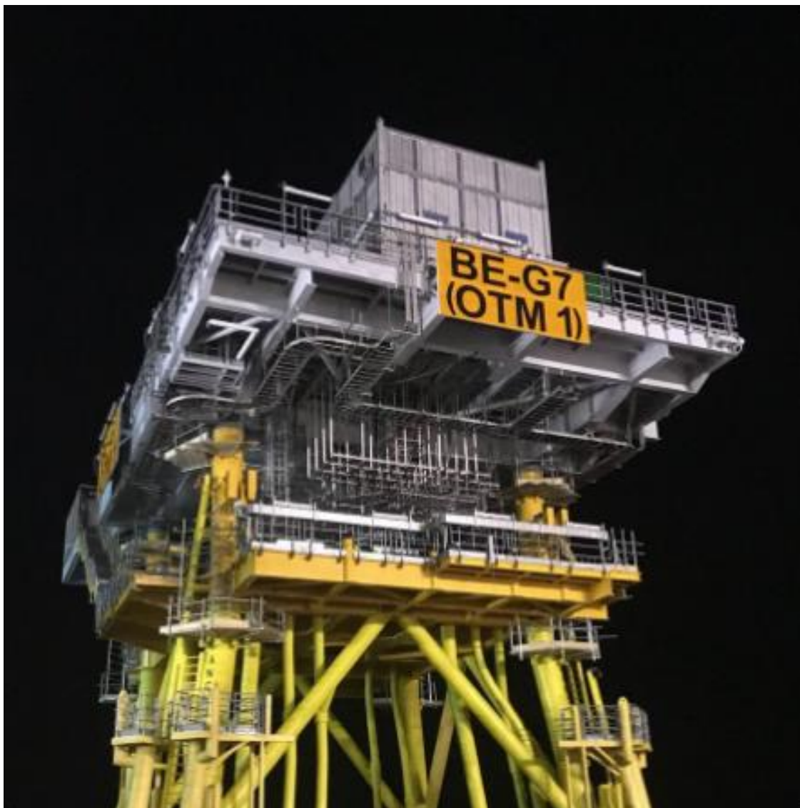
Fig 2 OTM 1 showing lower cable deck and J-tubes